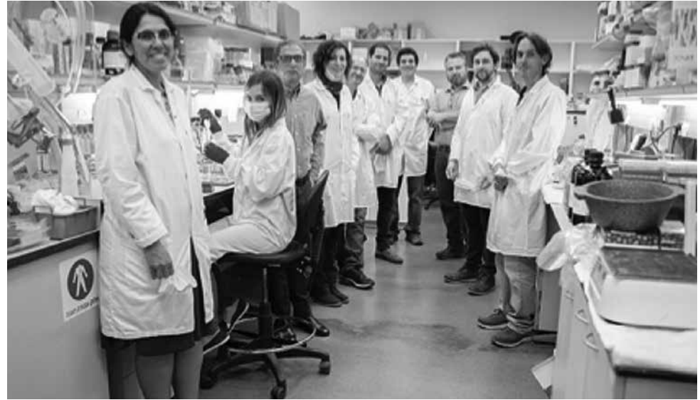
Researchers working on a Covid-19 vaccine at MigVax.

That's because so many labs are working toward a solution with immense governmental and foundation investment, and