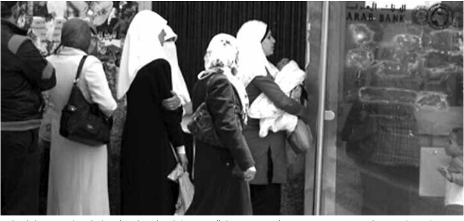
Palestinians receive their salary in a bank in Ramallah, West Bank, on May 17, 2011.

The military order, signed in February, applies substantial parts of Israel's anti-terror law to the West Bank. The law states that any