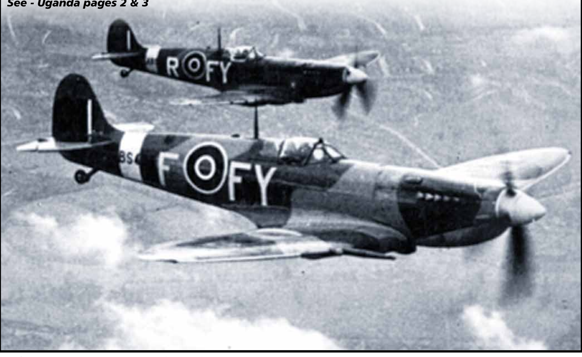
RAF Spitfires based at the Biggin Hill airbase in southern England. (Public domain)