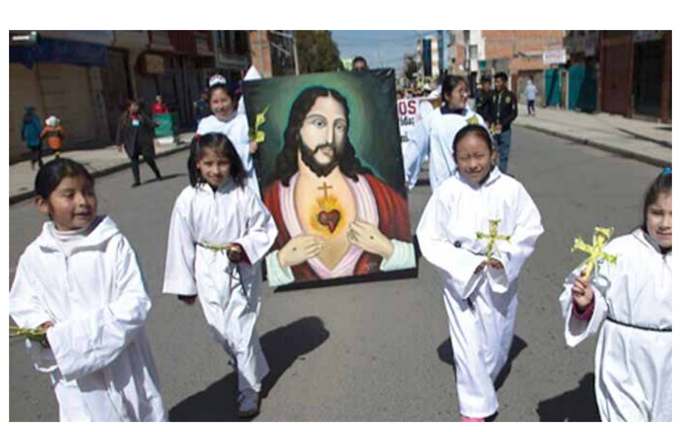
Altar girls carry a Sacred Heart painting of Jesus during a procession before Palm Sunday Mass in El Alto, Bolivia, April 14, 2019.

Jesus Christ supporting an English flag and staff in the crook of his right arm depicted in a stained glass window in Rochester Cathedral, Kent.